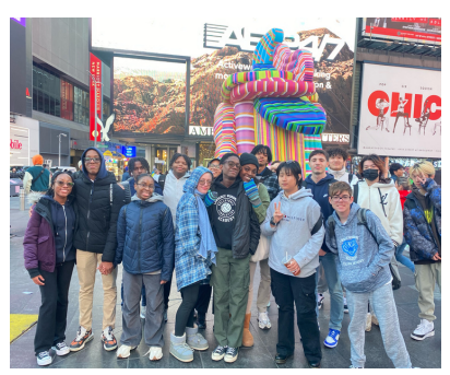
Seniors & Juniors