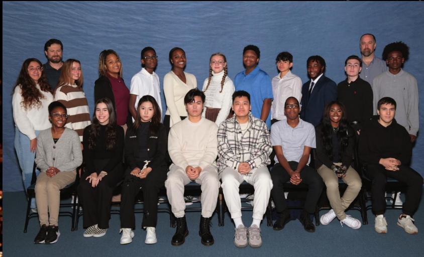
11 th Grade