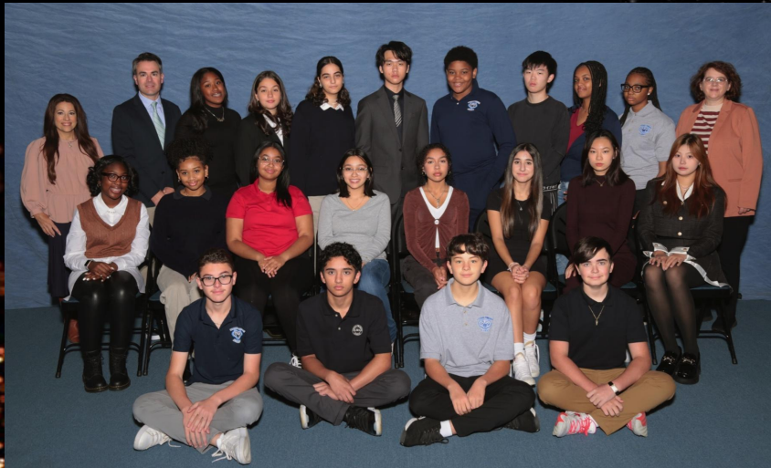
9 th Grade